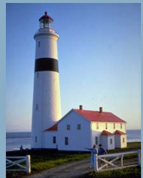
Point Amour Lighthouse