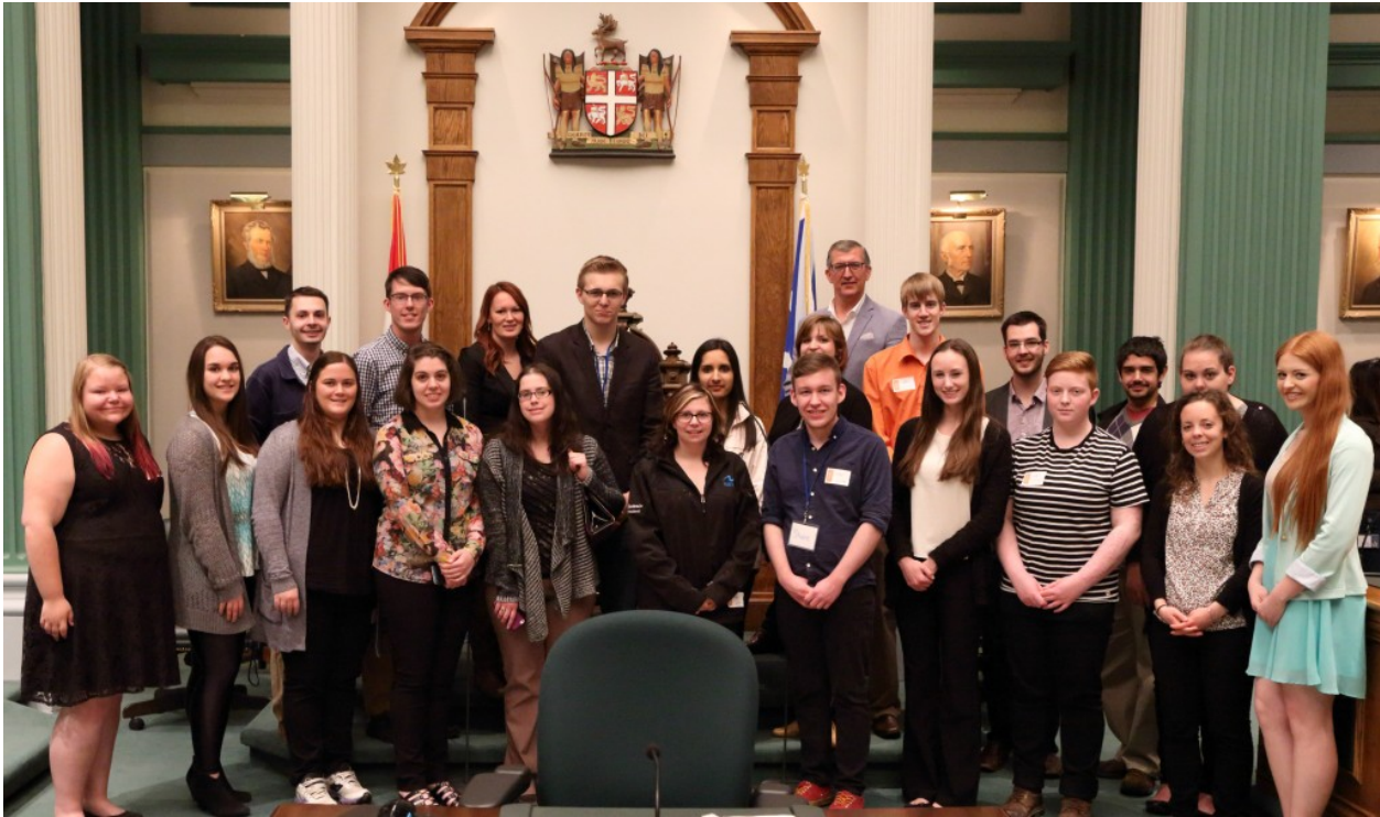
Members of the Premier's Youth Advisory Committee with Premier Paul Davis Premier's Youth Advisory Committee Face to Face Retreat, May 28-31, 2015