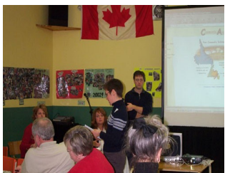
Recent presentation on Community Accounts in Virginia Park